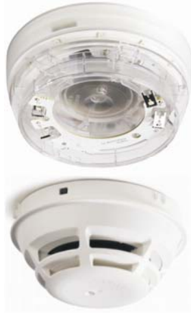
DBS721 or DBS729

For all point detectors designed for Cerberus PRO and fitting to the DB720 and DB721 base (i.e. OP720, OH720 HI720, HI722...:)